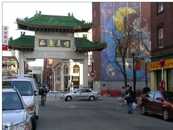
Figure 2. Chinatown, Boston.

Students build on their knowledge by carrying out assignments in Asian groceries, restaurants, and/or Chinatown. In Chinatown students can observe, eat, and experience living Chinese culture. Some students are surprised at how “foreign” Chinatown seems. Students prepare by reading Internet sites on the history of Chinatown and regional Chinese cuisines and apply their knowledge of Chinese culture to interpret what they observe. A food scavenger hunt is part of this field research and might include a Chinese pharmacy, a shrine, fresh and live food, cooked food in a window display, moon cakes or other festival food, ritual items, evidence of yin-yang, and marketing (e.g., teas with weight reduction claims). Students prepare a portfolio of their experiences in their chosen format, which is usually a write-up with photos or sketches, but has included videos, posters, and a zine (a noncommercial, often online publication). Twice students prepared and delivered a teaching unit to elementary school students, and once prepared a display on campus for Asian history month.